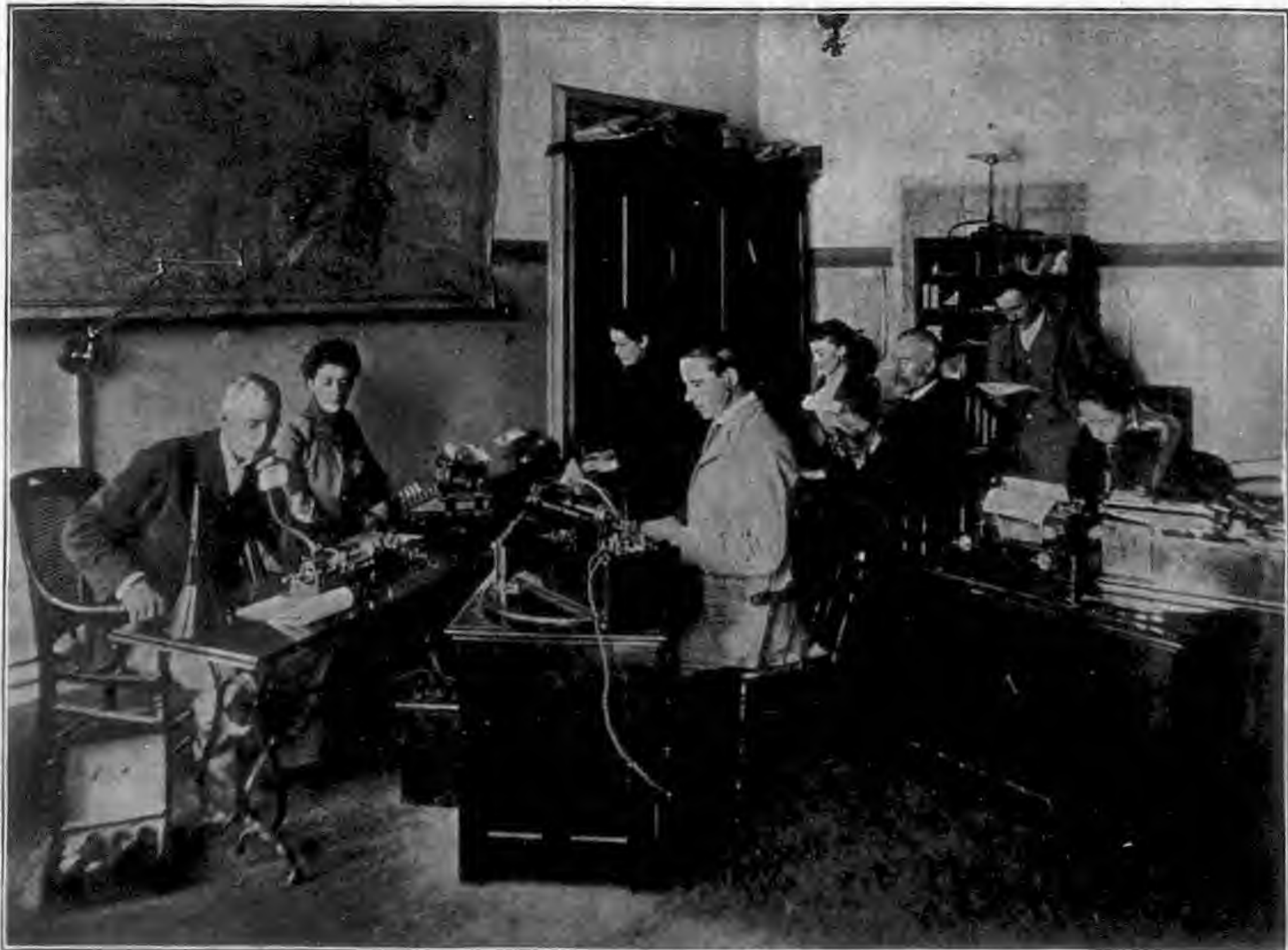
Senate Reporter's Room, House of Parliament, Canada.